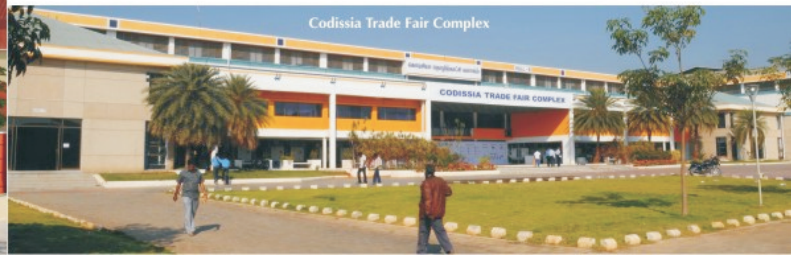
Codissia Trade Fair Complex