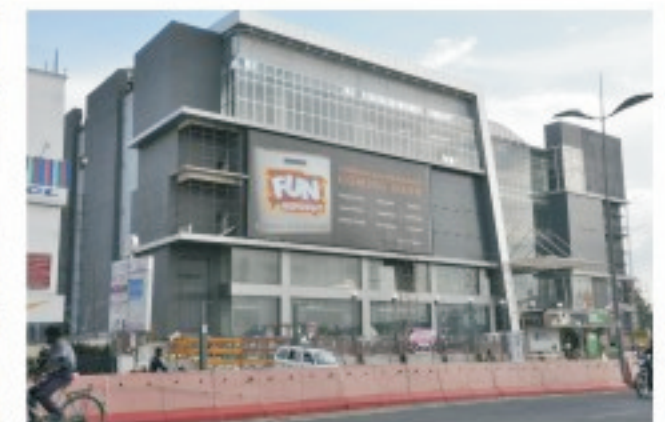
Fun Republic Mall